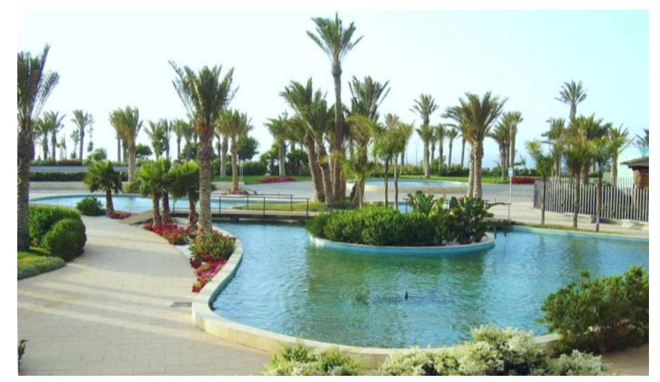
The park resembles an oasis which allows for visitors to walk through.