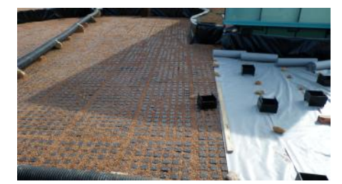
The filled drainage and water storage element Floradrain® FD 60 was covered with the filter Sheet SF.