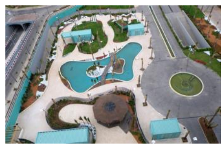
The spectacular view from one of the hotel rooms shows clearly the architectural concept of the park with its circle elements and curved lines.